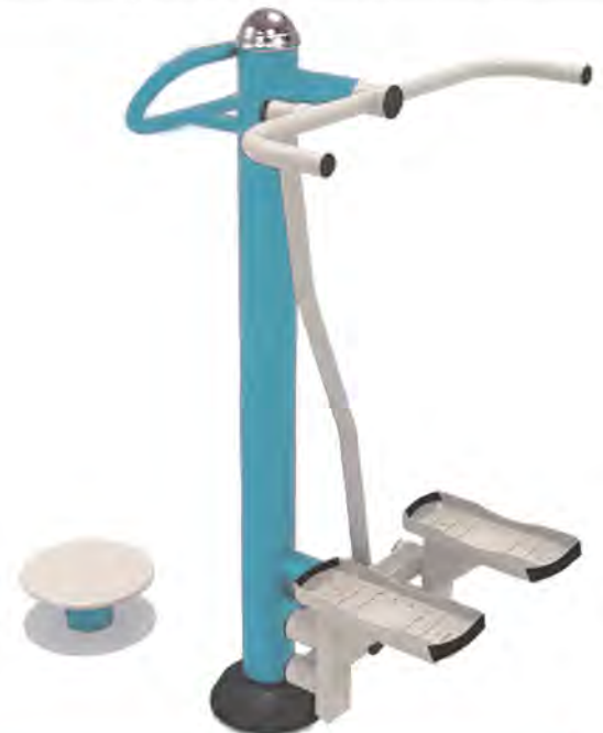
MS STEPPER WITH TWISTER