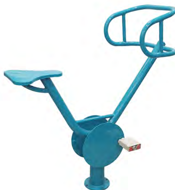
MS CYCLING MACHINE