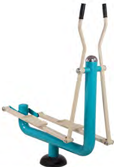
GI CROSS TRAINER