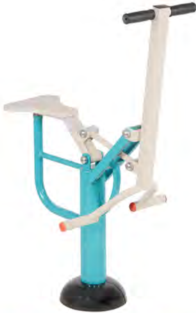
MS FITNESS RIDER