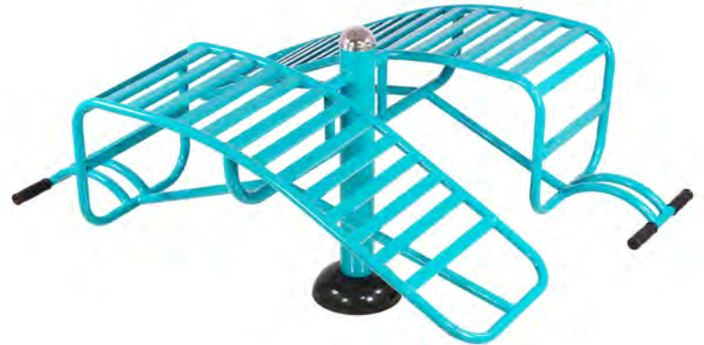
MS SIT - UP BENCH SET