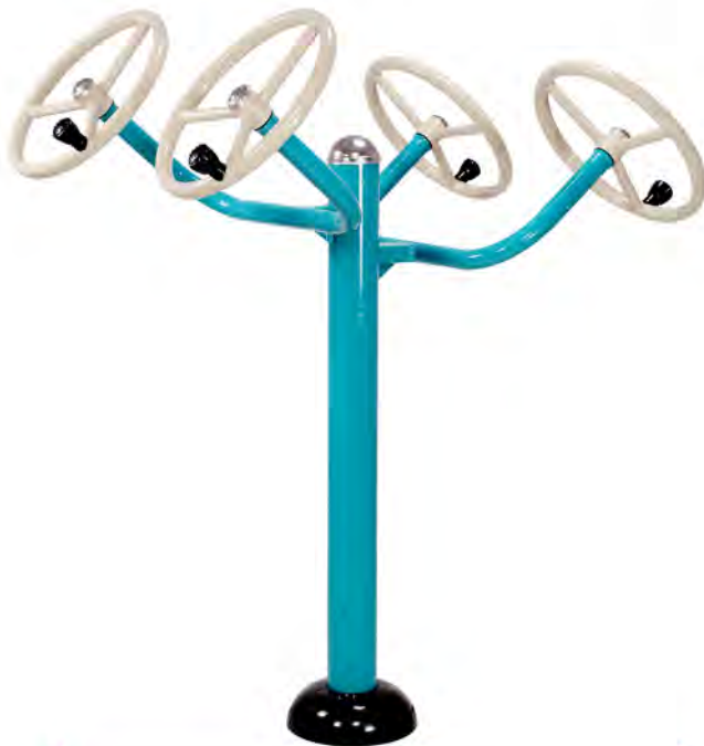
MS TAI - CHI SPINNERS