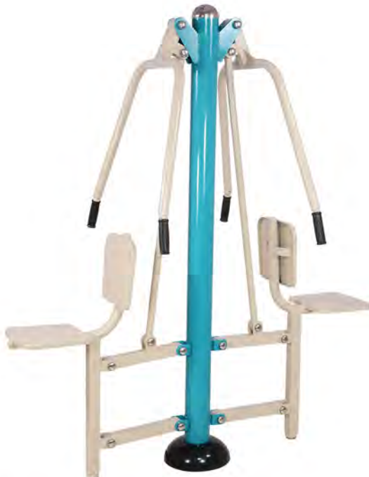
MS SEATER CHEST PRESS - DOUBLE