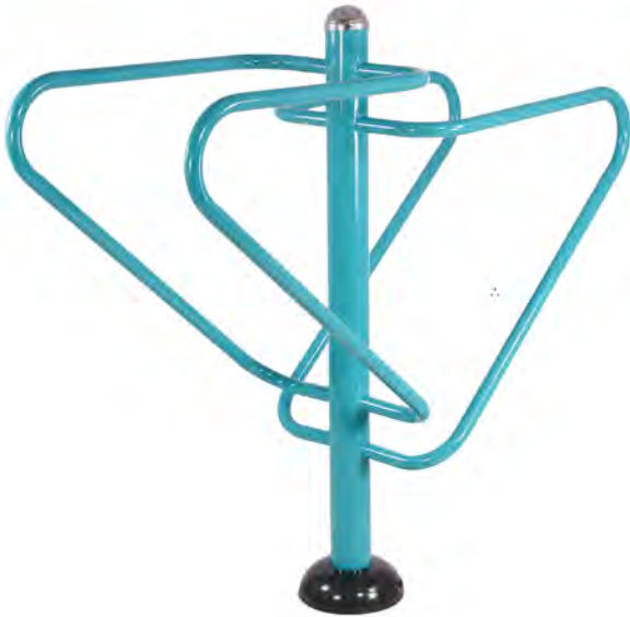
MS PUSH UP & DIP STATION