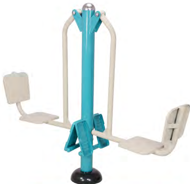
MS DOUBLE LEG PRESS