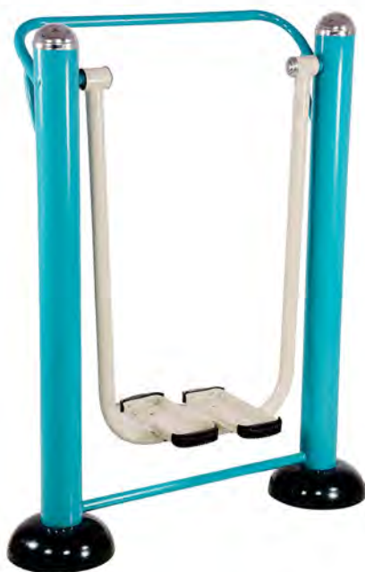
MS HEALTH WALKER