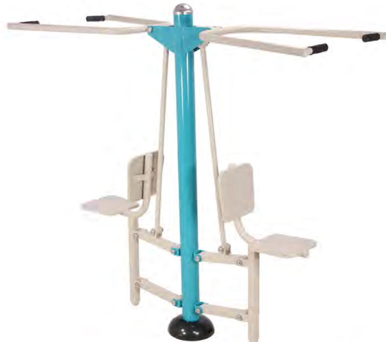
MS LAT PULL DOWN - DOUBLE