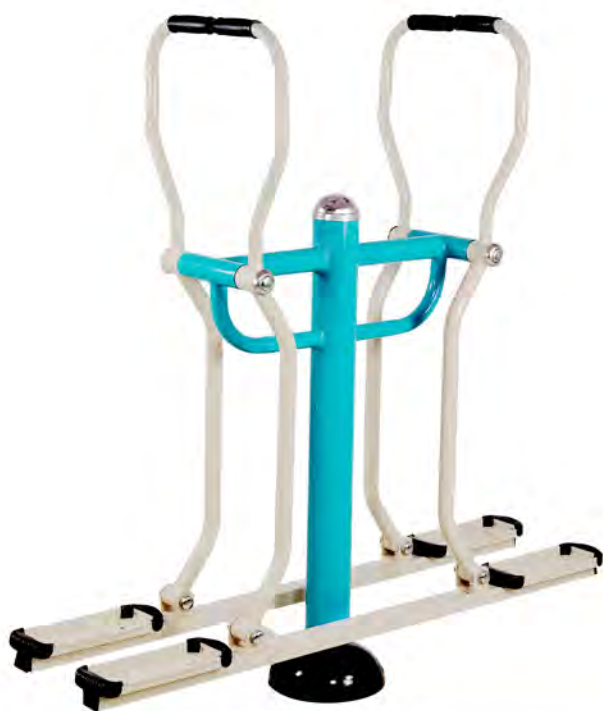
MS DUAL AIR STRIDER