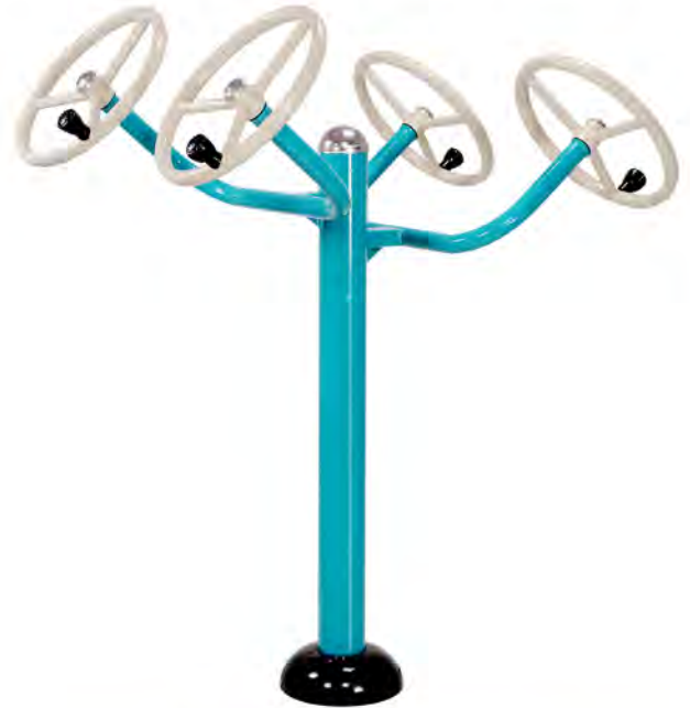
GI TAI - CHI SPINNERS