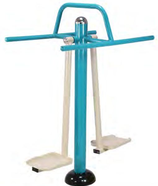
GI DOUBLE AIR SKIER