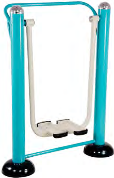
GI HEALTH WALKER