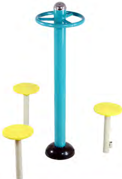
MS TWISTER STATION