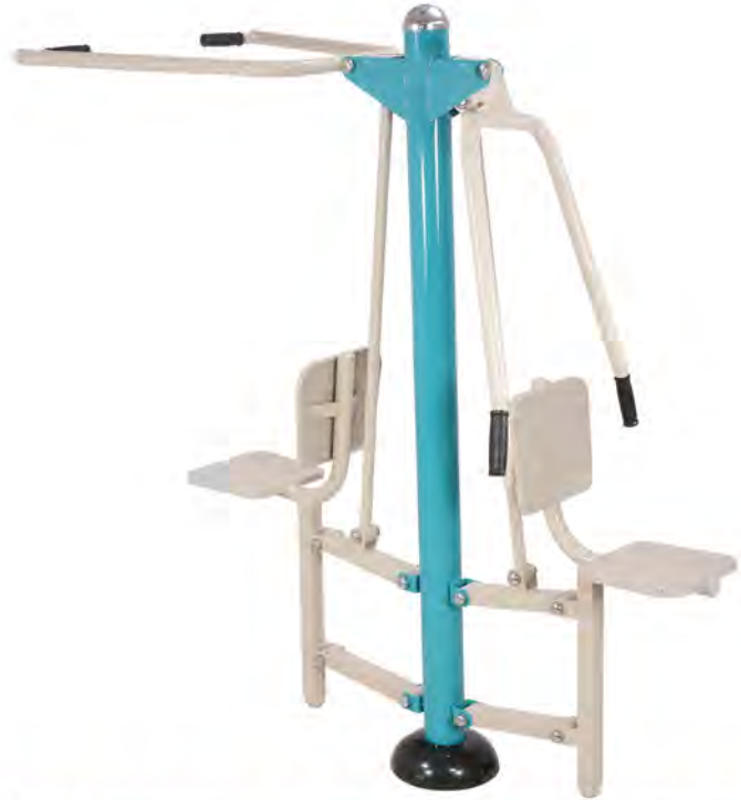
MS LAT PULL DOWN & CHEST PRESS COMBO