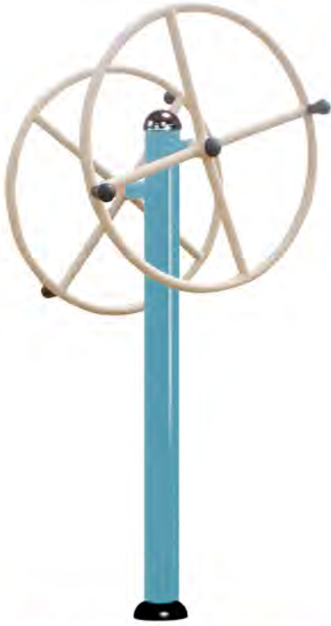
MS TURNING WHEEL