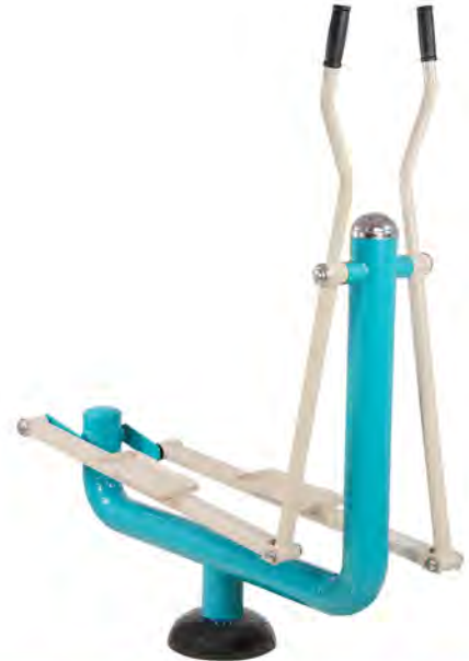
MS CROSS TRAINER